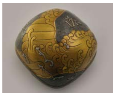
Kitsune Rue des Minimes 55