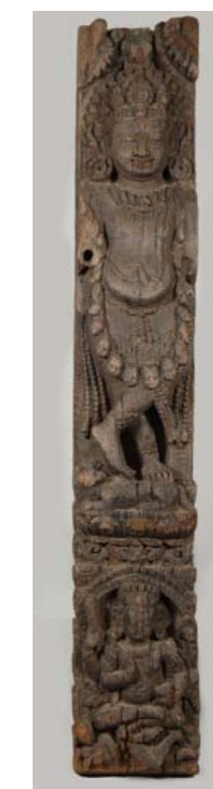
Wei Asian Arts Rue Van Moer 5