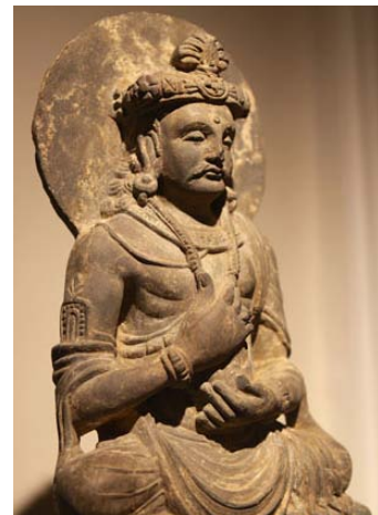
Famarte At Maison Costermans Place du Grand Sablon 5