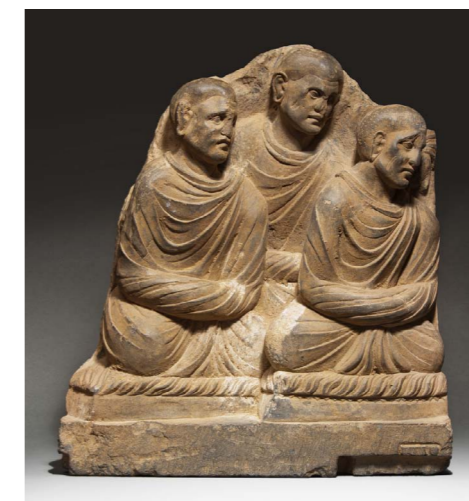
Alexis Renard At Flamant Place du Grand Sablon 36