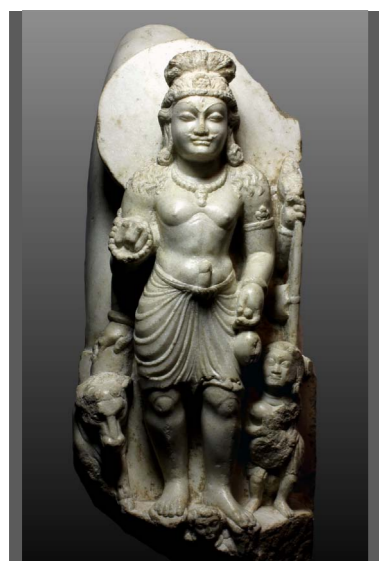
Indian Heritage At Galerie Chrischilles Rue des Minimes 58

2014 edition,' comments Cristi. 'The combination of the three fairs—Asian art, antiquities, tribal art—while attracting different collectors, stimulates a crossover, curiosity and the possibility of new clientele. Still, each fair is a specific fair, attracting a specific type of collector.' Full programme details, along with an online catalogue, are available at www.asianartinbrussels.com/index.html