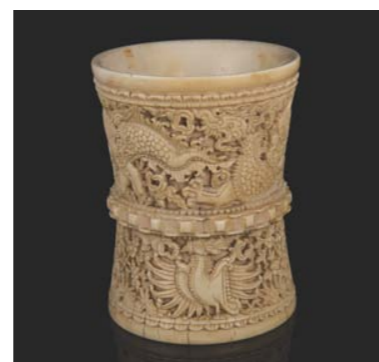
Galerie Lamy Rue Ernest Allard 32