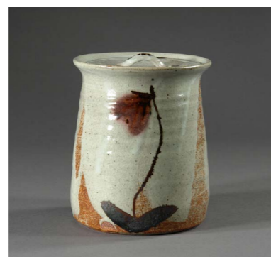
André Kirbach Rue Coppens 3