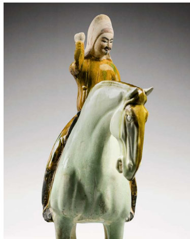
Gisèle Crôes Avenue Emile Duray 44