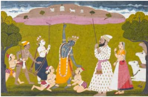
Krishna lifts Mt. Govardhan, Kishangarh, India, circa 1750, gouache and gold on paper, 19.3 x 29.5 cm, Kapoor Galleries

framed by his architectural surround. There is a rare and complete grey schist Gandharan, 2nd/3rd-century stupa, but the most impressive of all is a 12th-century Rajasthan, or Gujarat, sandstone Jina Tirthankara where the standing nude figure is partly framed by an architectural surround. At 100 cm, it is monumental in scale and would be very impressive at any size.