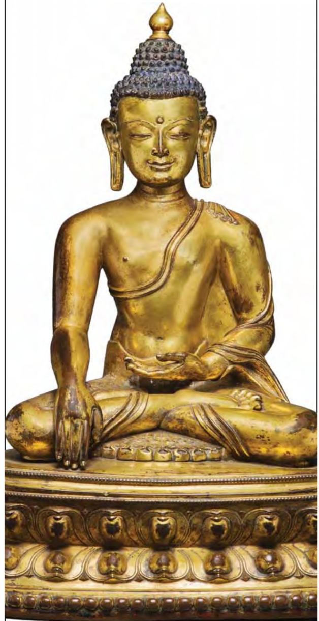
Buddha - Nepal - Circa 14th Century - 23 1/2 in. (59.7 cm)